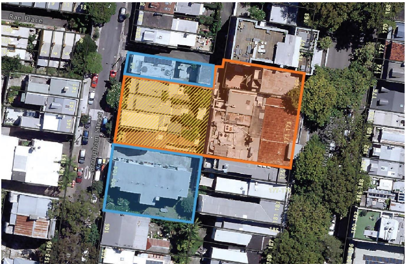
Figure 5. The Piccadilly Hotel