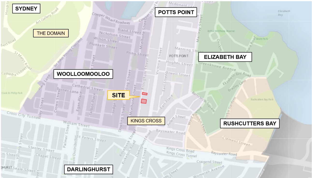
Figure 2. Indicative plan showing the site's context and suburb boundaries