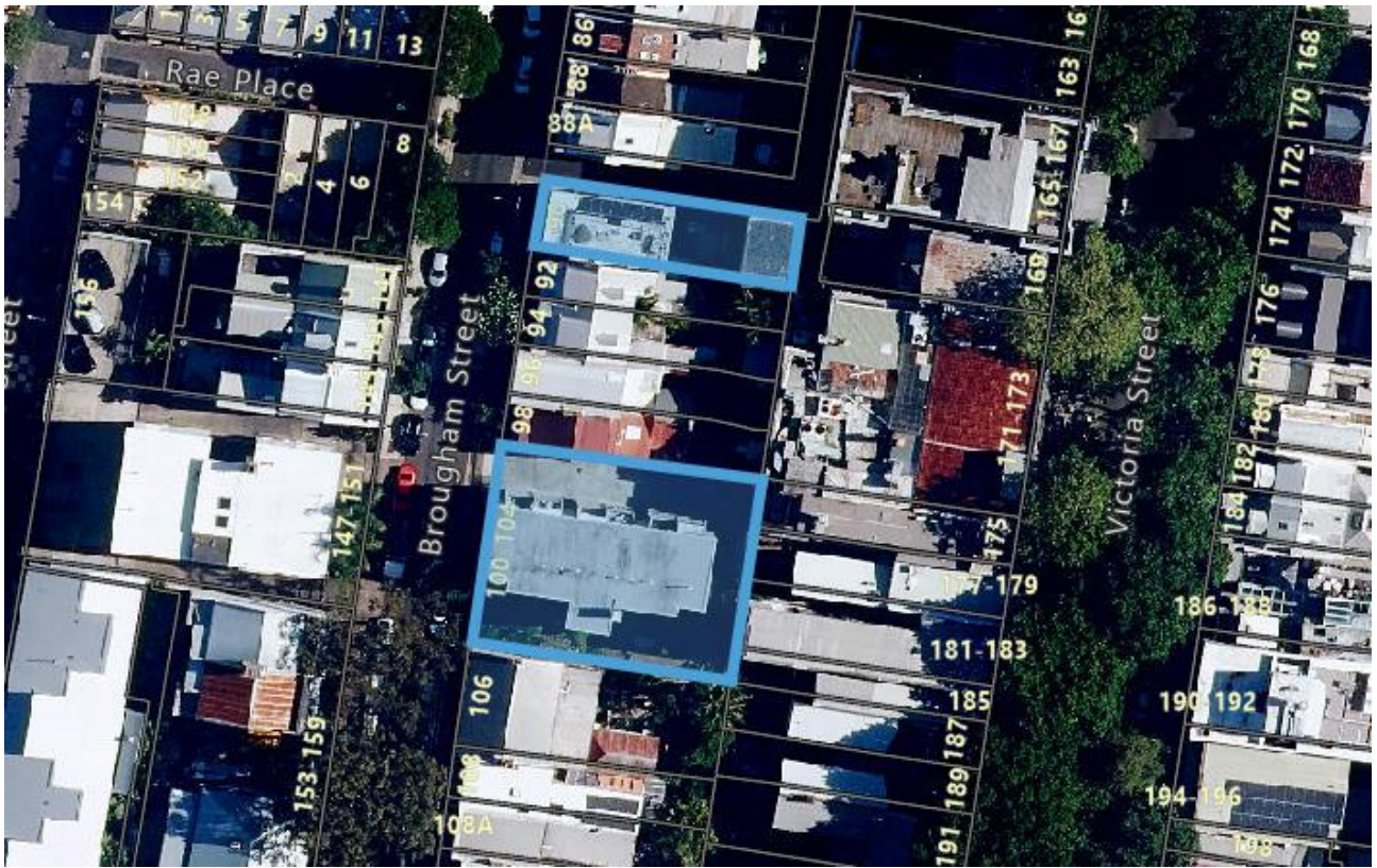
Figure 1. Aerial image showing the site's location

The site is located in Potts Point approximately two kilometres east of Central Sydney. Uses along Brougham Street are predominantly residential, and the most common building type is three storey terrace dwellings with dormer roofs. There is approval for a hotel use at 92-98 Brougham Street, which sits between these two properties.